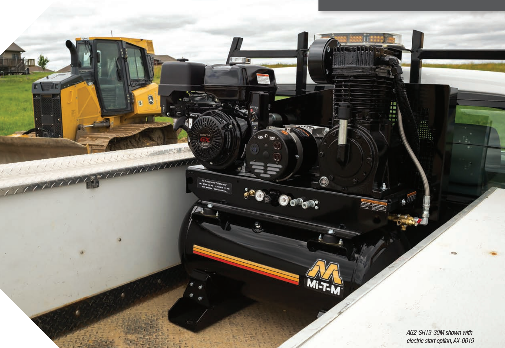
AG2-SH13-30M shown with electric start option, AX-0019