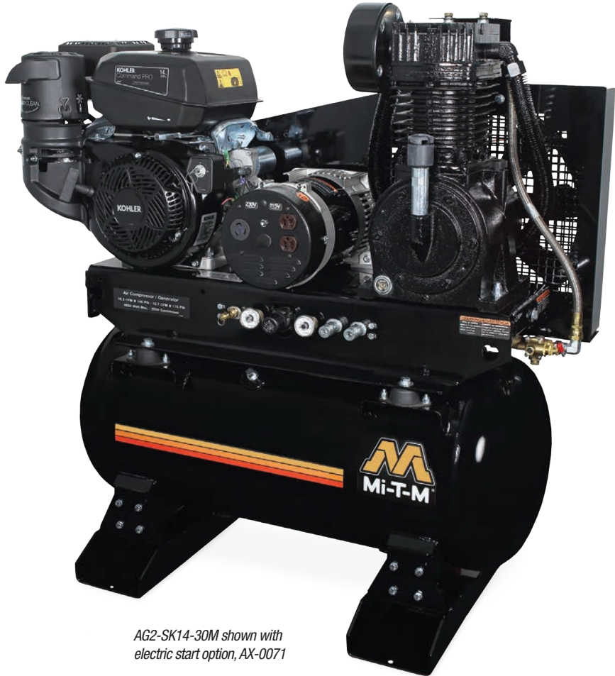
AG2-SK14-30M shown with electric start option, AX-0071