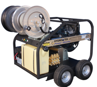
Shown with Wheel kit and hose reel options

8 gallon float tank, Hour meter, Emergency air choke shutoff, Stainless hose reels (150-250ft), Stainless drip pan, Custom color frame, Wheel kit, Trailer and Tank skid