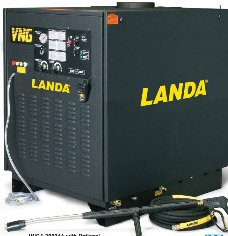
VNG4-30024A with Optional LanCom Wireless Remote

■ Rugged Steel Cabinet , with vented panels, is painted with an epoxy powder coat finish for all-weather protection.