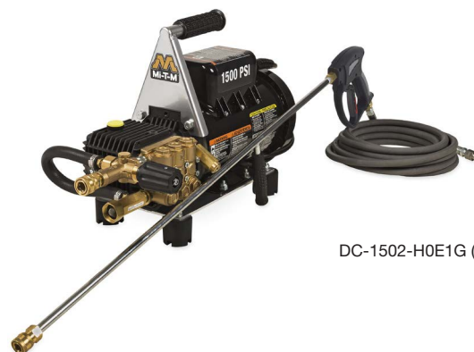
DC-1502-H0E1G (Hand Carry)